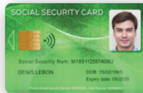
Card printed with YMCKOO ribbon

Bringing extra durability without lamination, YMCKOO ribbon is a cheaper and more convenient solution when patch protection is not required.