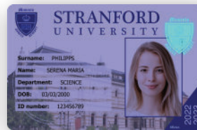
Under UV light

It is also possible to insert the same element in both layers to get a more intense UV effect, in a place where printing protection is not needed.